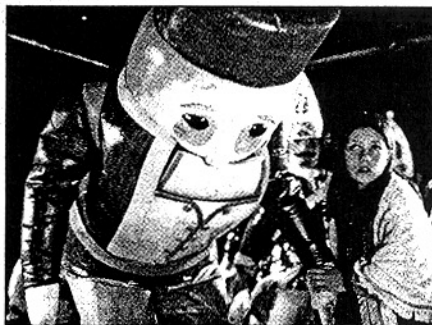
BIG SHOW: The 1997 "IMAX Nutcracker" is back at the Sony Lincoln Square.